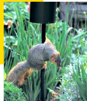
A large, torpedo-style baffle will deter squirrels and raccoons.

2) Mount a baffle on the post or pole. Top must be 5' off the ground and feeders should not hang below baffle.