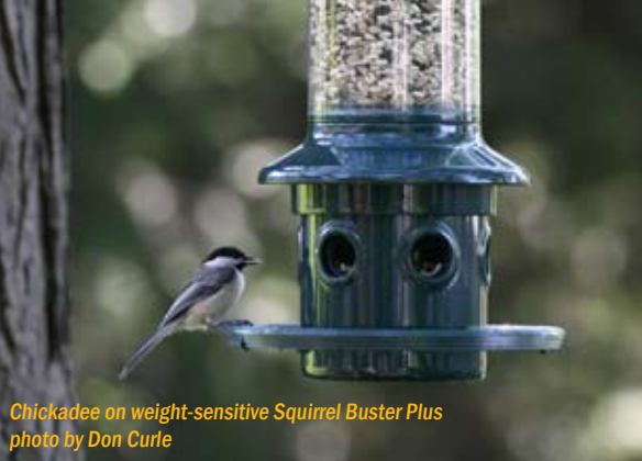
Chickadee on weight-sensitive Squirrel Buster Plus