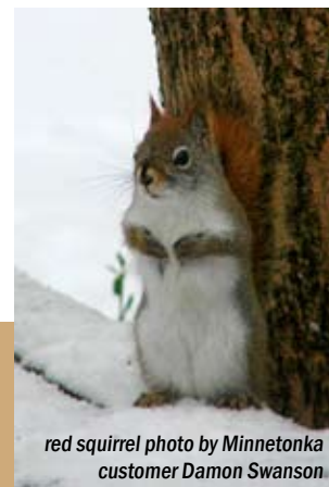
red squirrel

You can also use a pepper mix called "Squirrel Away" on any bird seed. Again, the birds have fewer taste buds and can't taste the pepper, but the squirrels can. An effective way to apply the hot pepper mix is to lightly coat the seed with an oil spray so that the pepper adheres better to the seed. If you use suet and don't want to use baffles, there are hot pepper cakes and plugs that are effective in keeping the squirrels at bay.